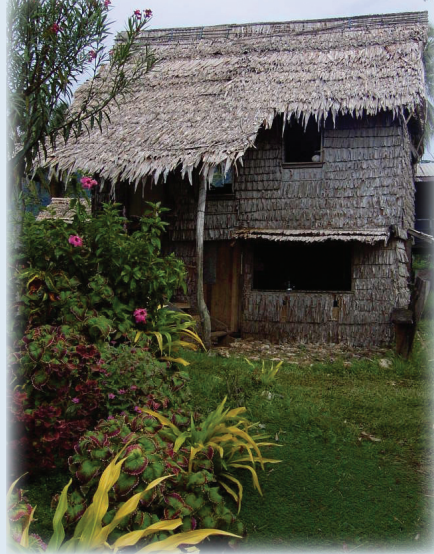
Leaf house on Mlaita,