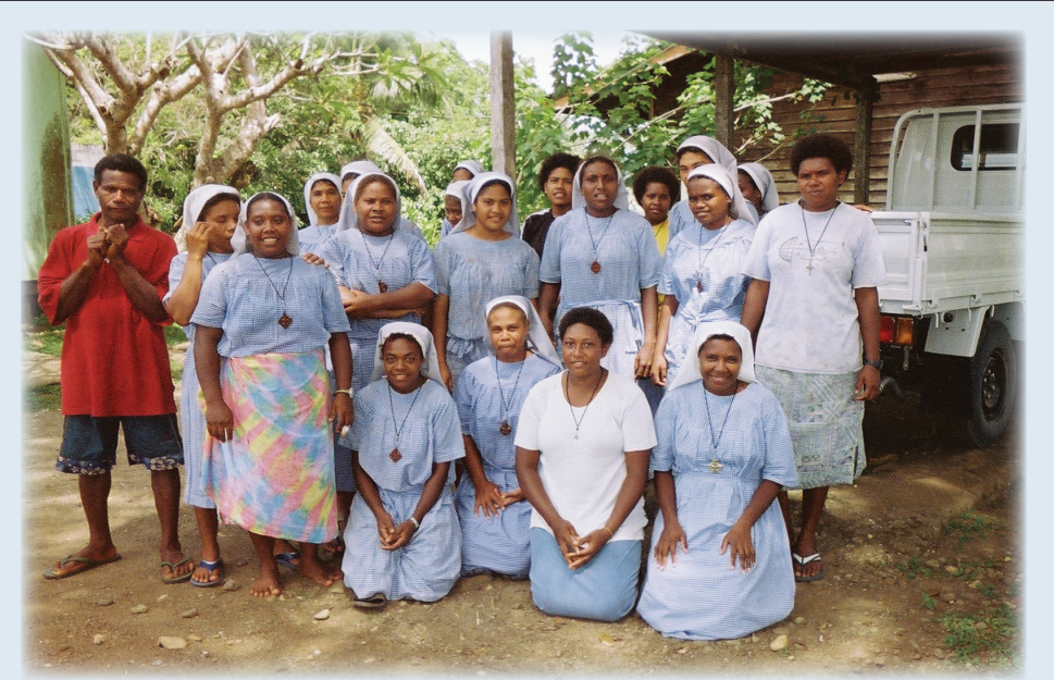
Sisters of the Church, Solomon Islands

This is real evangelism that goes on largely unsung, un-financed, undocumented. These evangelists walk the roads with bare feet and no money. These are evangelists whom people can welcome in their homes like returning sons or daughters, who will share whatever food there is and who will sleep on a mat and help hoe the garden, catch the fish or repair the roof. These are the evangelists who will come whenever they are called to pray for the sick, solve a village dispute, calm down a husband who is drunk. And when they visit, they bring a sense of goodness, the sense that something better is possible. 4