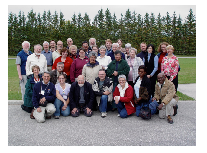
EcoJustice Consultation, Winnipeg, MB, October 2005